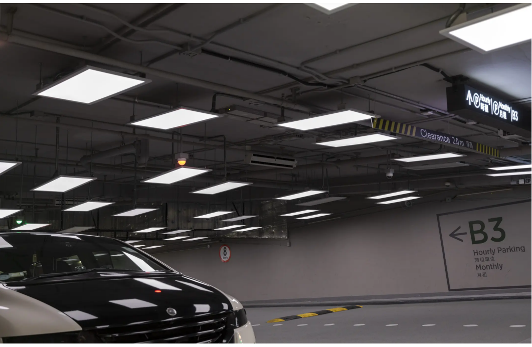
Functional light panels are arranged in pixelated arrangement to create an unexpected ceiling feature.