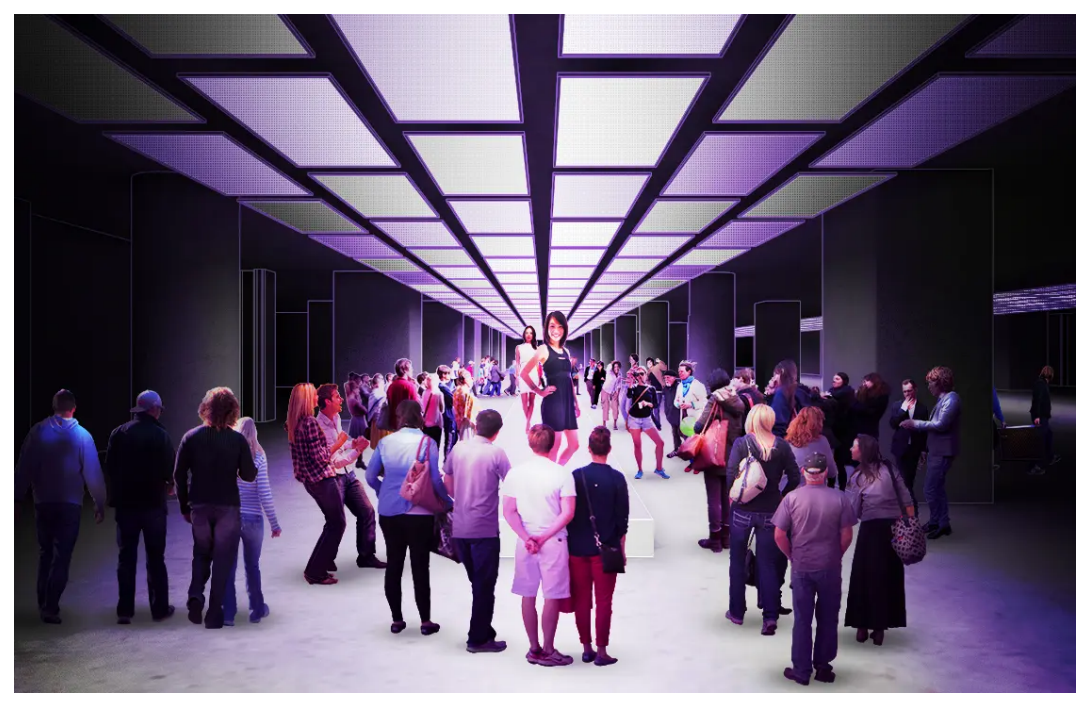
Carparks become a place for shows, parties and installations.