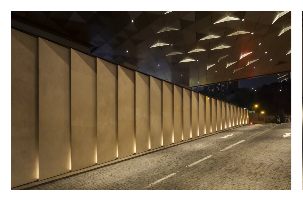
Rhythmic wall mounted light features at the entrance ramp provide the required light levels by day and by night.